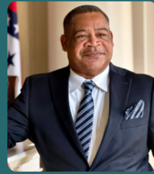
JUDGE CARLTON JONES