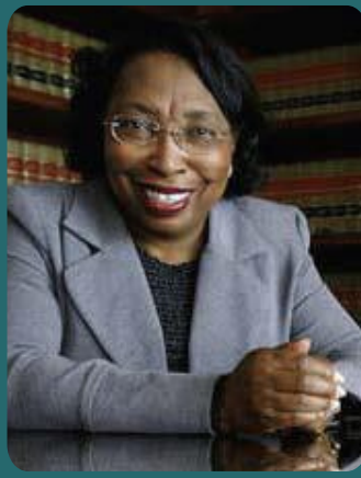
RETIRED JUDGE BERNICE DONALD